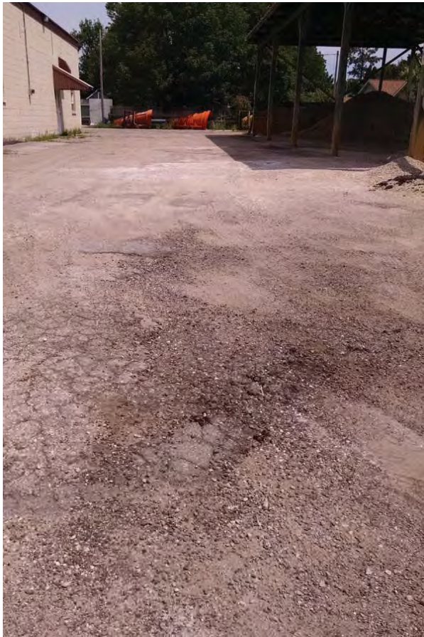
Lake City Shop