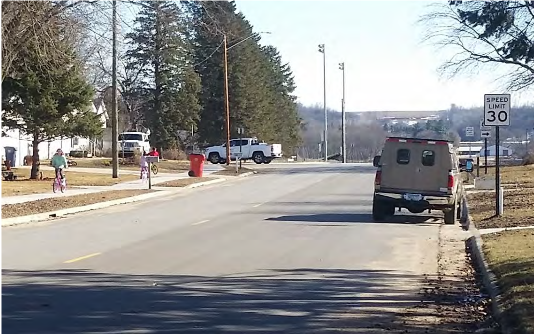
Photo of CSAH 2 in Elgin after 2017 construction